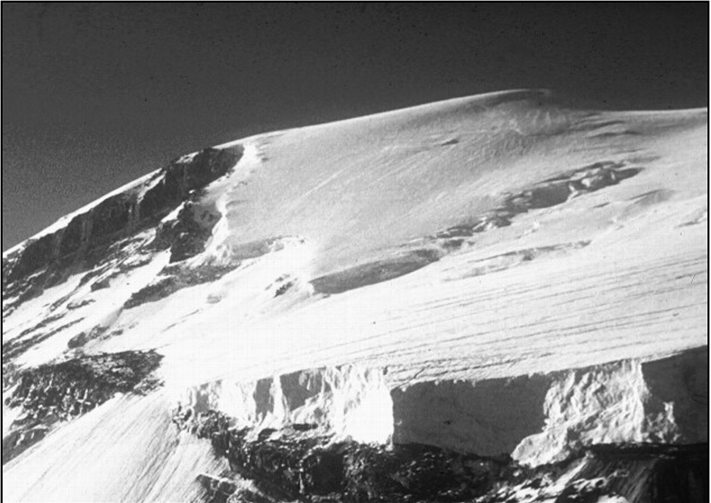
Slide scan of upper Ahora Gorge and Abich II depression 1972