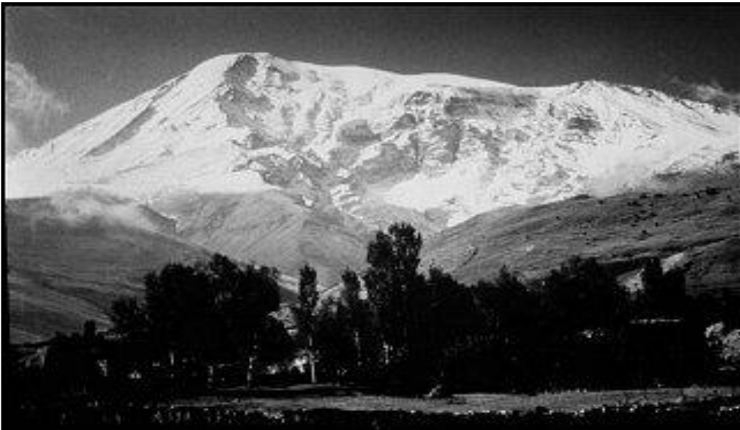
Northeast of Mount Ararat including Ahora Gorge 1977

That initial curiosity began two years of research, after which I became convinced that there was a good possibility that there might have been something preserved. At that time in my life, God was working in a special way and really drawing me spiritually closer to him and I felt a calling to be involved in the search. I felt that the background I had in mountaineering, cave exploring and rope work could be useful in the Ark research. I began preparing for a possible trip to eastern Turkey and to Mount Ararat. This led to a solo trip to the mountain and what I call a spiritual odyssey in 1978.