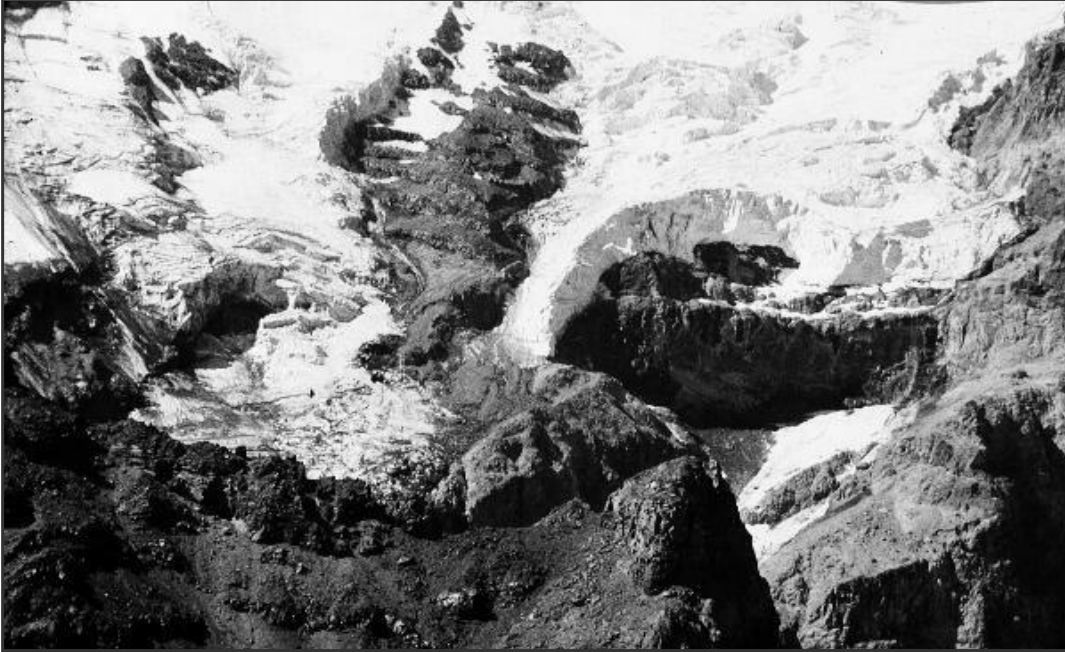
Bottom of Abich II Glacier near Avalanche Canyon 1983

In August of 2000 I again visited the Ararat area to visit friends from past years and to appraise the situation on and around the mountain. A few small, secret groups were reporting having done research but no recognized foreign research group was being given permission to do research. From the secret groups there were reports of using local people to gain access to the mountain and in some cases of paying a military contact in order to gain access.