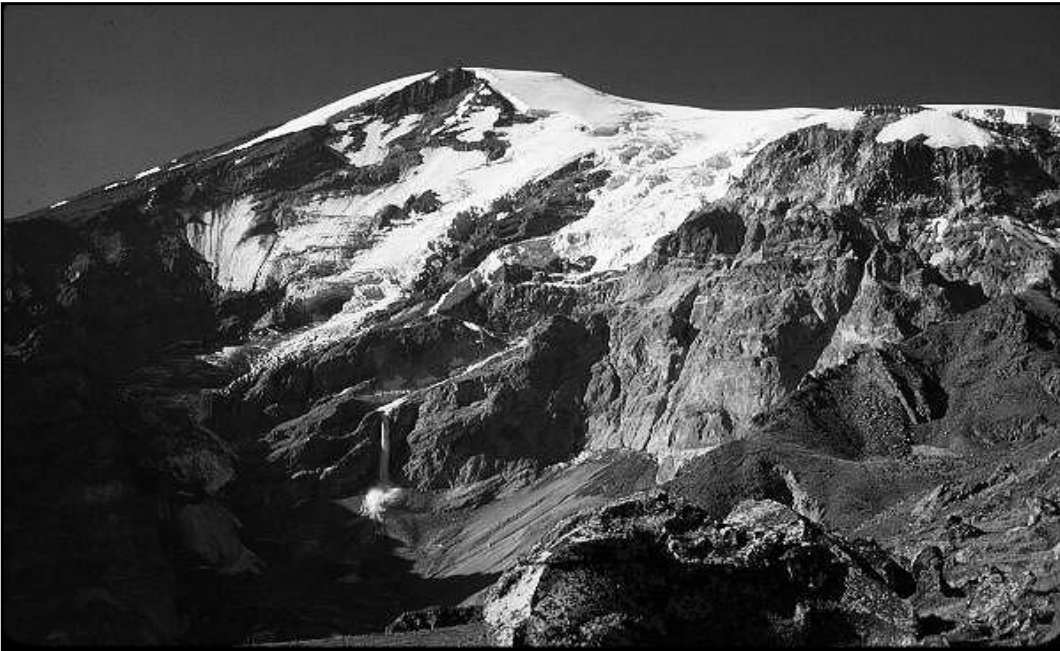
Ahora Gorge snow and ice avalanche coming from the Abich II Glacier 1978

As I was about to proceed north along the base of the steep cone, I noticed three horses directly north of me right on my route. I decided the only way to avoid them was to go up the cone and try to drop back down behind them. So I began a very long slow hike up the western side of Mt. Ararat. This turned out to be a two-day hike up the side of the cone. I got up on the steep side of the mountain into an area of finger glaciers that dropped off very steeply. I couldn't cross them at their widest points and had to climb up the cone to where they narrowed. Basically, I stair-stepped up the western side of