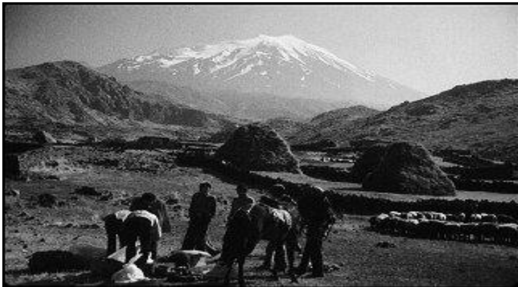
Southwestern foothills of Mount Ararat 1982

The next day I continued northward down the slope, crossing over the western rim of the Ahora Gorge and spent the night on the west rim. This allowed me to take some very special pictures of the gorge, including one of an ice avalanche going over a 450-foot fall.